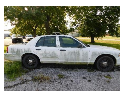
Car #5 2006 Ford/Crown Vic White Aprox 170,000 miles Rear main seal out Bad Ignition switch