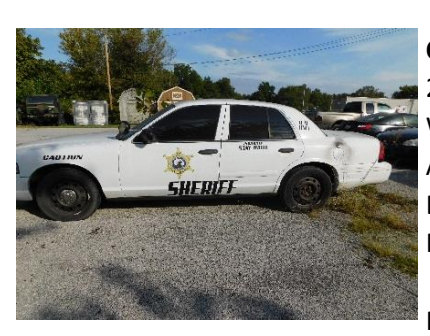
Car #3 2008 Ford/Crown Vic White Approx 200,000 miles Bad transmission No Alternator